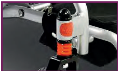
Hi-Torque front suspension

The i-Go from Pride Mobility features an advanced folding technology, enabling it to be transported with ease. The i-Go features front suspension, a durable seating system, under seat storage and much more. Designed to fit inside any small space, the i-Go is the perfect choice for the active individual.