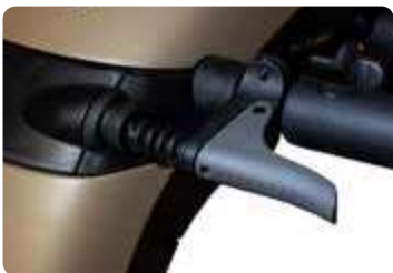
Tiller adjustment lever

Rugged and built to last; the Ranger is everything you want in an outdoor scooter! Equipped with front and rear suspension, this aggressive scooter is designed for cruising on walking trails or driving around your property. Enjoy total visibility with complete LED lighting. With a user-friendly console and dual hydraulic brakes for added safety, the Ranger is the perfect way to embrace life in the great outdoors!