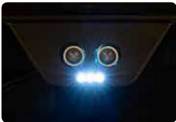
Backup sensors with LED light