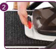
Pull up lever to fold