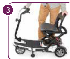
Unfold seat; lock in place