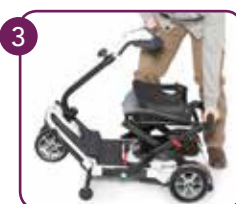
Fold and lock tiller