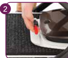
Pull up lever to fold