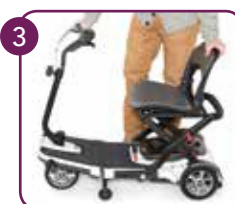
Unfold seat; lock in place