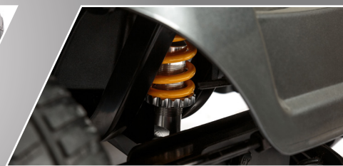
Front and rear CTS suspension