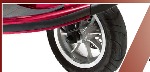
13" pneumatic tires

The Victory Luna 3-Wheel mobility scooter delivers powerful performance both indoors and outdoors.