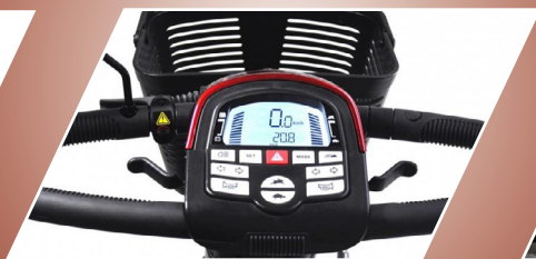
Easy to operate tiller display