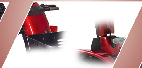
High quality design