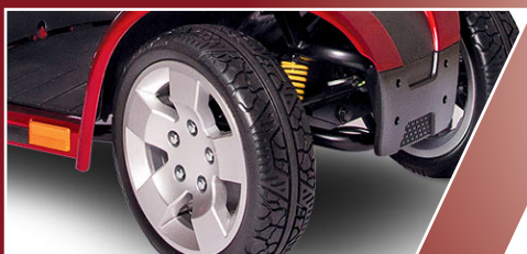
13" pneumatic tires

Luxury details, such as a continuous delta handlebar and bright LED lighting, give the Victory XL 130 a streamlined and sporty design.