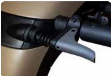
Tiller adjustment lever

Rugged and built to last; the Ranger is everything you want in an outdoor scooter! Equipped with front and rear suspension, this aggressive scooter is designed for cruising on walking trails or driving around your property. Enjoy total visibility with complete LED lighting. With a user-friendly console and dual hydraulic brakes for added safety, the Ranger is the perfect way to embrace life in the great outdoors!