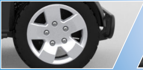
13" pneumatic tires

Discover the ultimate combination of comfort, performance and style with the Atmos. This mobility scooter is equipped with premium suspension, resulting in a smooth and stable ride on various terrains.