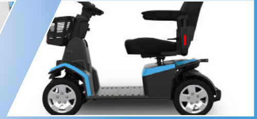
Comfortable dual suspension