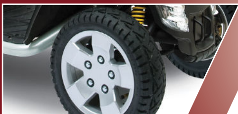
13" pneumatic tires

With its shiny, aggressive style and numerous standard luxury features, such as a full-length delta handlebar and LED lighting, the Victory XL 140 is the ultimate choice for outdoor use.